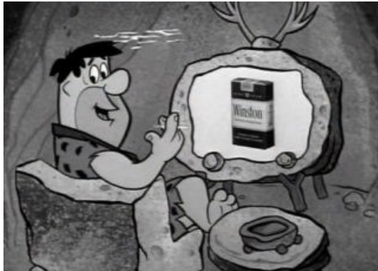
The Flintstones were one of many programs aimed at younger audiences that took on major tobacco sponsorships. Fred Flintstone and friends were used to market Winston cigarettes.

From the 1920s through the 1940s, tobacco companies enjoyed unprecedented successes. Even still, tobacco companies continued to aggressively