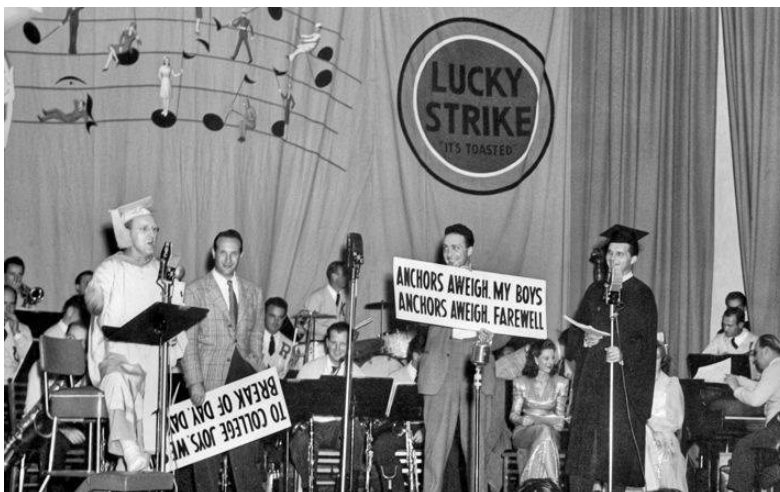
Many variety TV shows were sponsored by major cigarette brands such as Lucky Strike. Seen here is Kay Kyser, a popular radio artist born in NC, most known for Jack Benny and the Kay Kyser Kolledge of Musical Knowledge .

Opposition to the targeting of teens and young adults by tobacco advertising rose after medical studies began to confirm beliefs that cigarette smoking was linked to cancer. An article titled "Cancer By the Carton," published in Reader's Digest in 1952, showed the results of a medical study that found a relationship between the increase in the rate of cigarette smoking and the increased number of lung cancer cases. In 1953, Time Magazine published an article titled "Beyond Any Doubt," which stated that instances of lung cancer had increased in men by 400%, and by